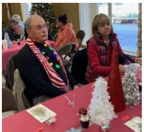
complete with a charming and tasty brunch table, holiday music and many new and old friends in attendance.